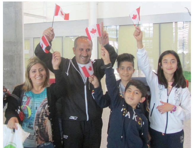
This photo was taken shortly after landing at Pearson Airport.

On June 1st the Woodfield Resettlement group welcomed a refugee family of five. Originally, from the Aleppo area in Syria, they had been living in Lebanon. Our group and the Woodfield community had been waiting patiently for well over a year. And then, we had only a few weeks notification of their arrival and we shifted into high gear. We found an apartment in Woodfield and the family has been enjoying their new home and surroundings. Parents and three children have been studying English diligently and the active and enthusiastic children are at St. George's Public School. We are so fortunate that our group of volunteers has access to many resources in London and expertise in areas that are helping the family to resettle. We are immensely grateful